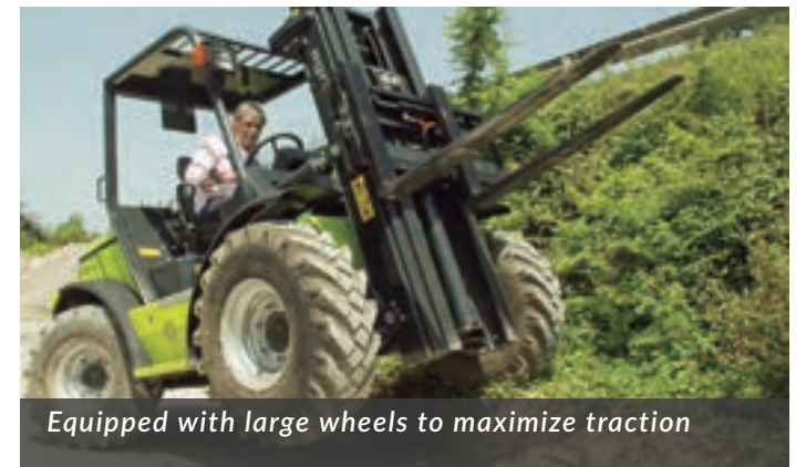
Equipped with large wheels to maximize traction