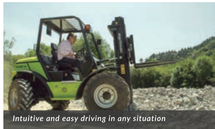
Intuitive and easy driving in any situation