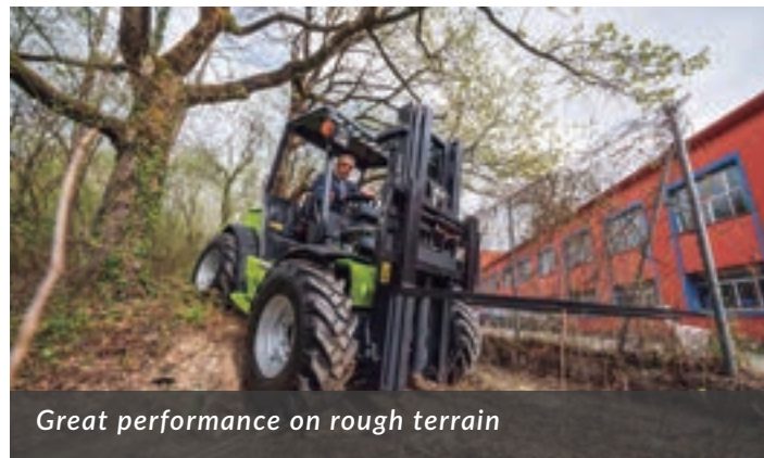
Great performance on rough terrain