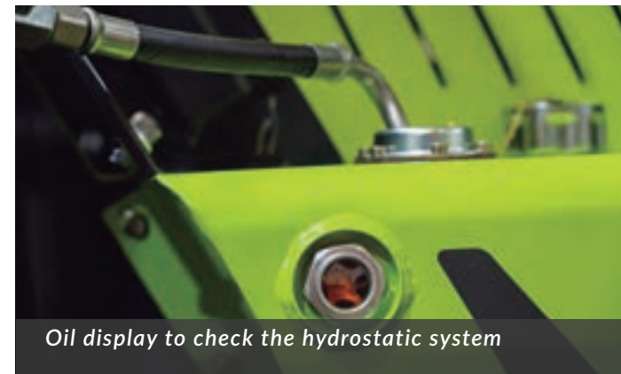
Oil display to check the hydrostatic system