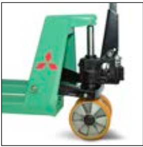
Controlled lowering valve